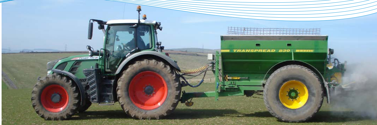
Figure 1. Lime spreading