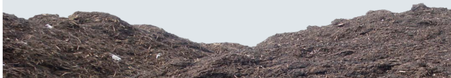
Figure 3. PAS 100-accredited food/green compost, which can be a useful liming agent.

He then conducted tissue analysis on his crops and tested his soil for pH. The crops were indeed manganese-deficient and the soil pH was sitting at 7.6. What the farmer had failed to realise was that this particular compost had a significant neutralising value (as some, but not all, composts do). Applying this compost had had a measurable (and in this case undesirable) impact on the pH of his soils. When applying organic materials which might have a neutralising value (in particular composts [including mushroom composts], fibre digestates, paper crumbles and biosolids) you should always ask the seller/provider for test results showing its neutralising value. If the seller/provider does not know (and they often don't!) then it is worth getting the material tested for its neutralising value at a reputable lab.